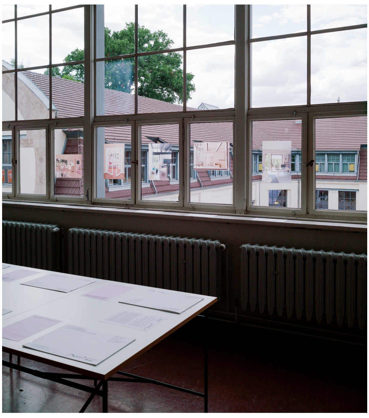
Exhibition Das Einfamilienhaus zur Disposition as part of summaery 23.

The discussions also covered the significance of living in a single-family house and the residents' (future) desires for change. The structural details of each house were documented in plan drawings. Prominent processes, such as the residents' patterns of use, were illustrated through diagrams and/or sketches. Model construction was employed to further illuminate a specific area within the home that was highlighted during the interviews. Through these replicas, we aimed to transfer and tangibly represent the appreciation for these spaces and their atmospheric qualities.