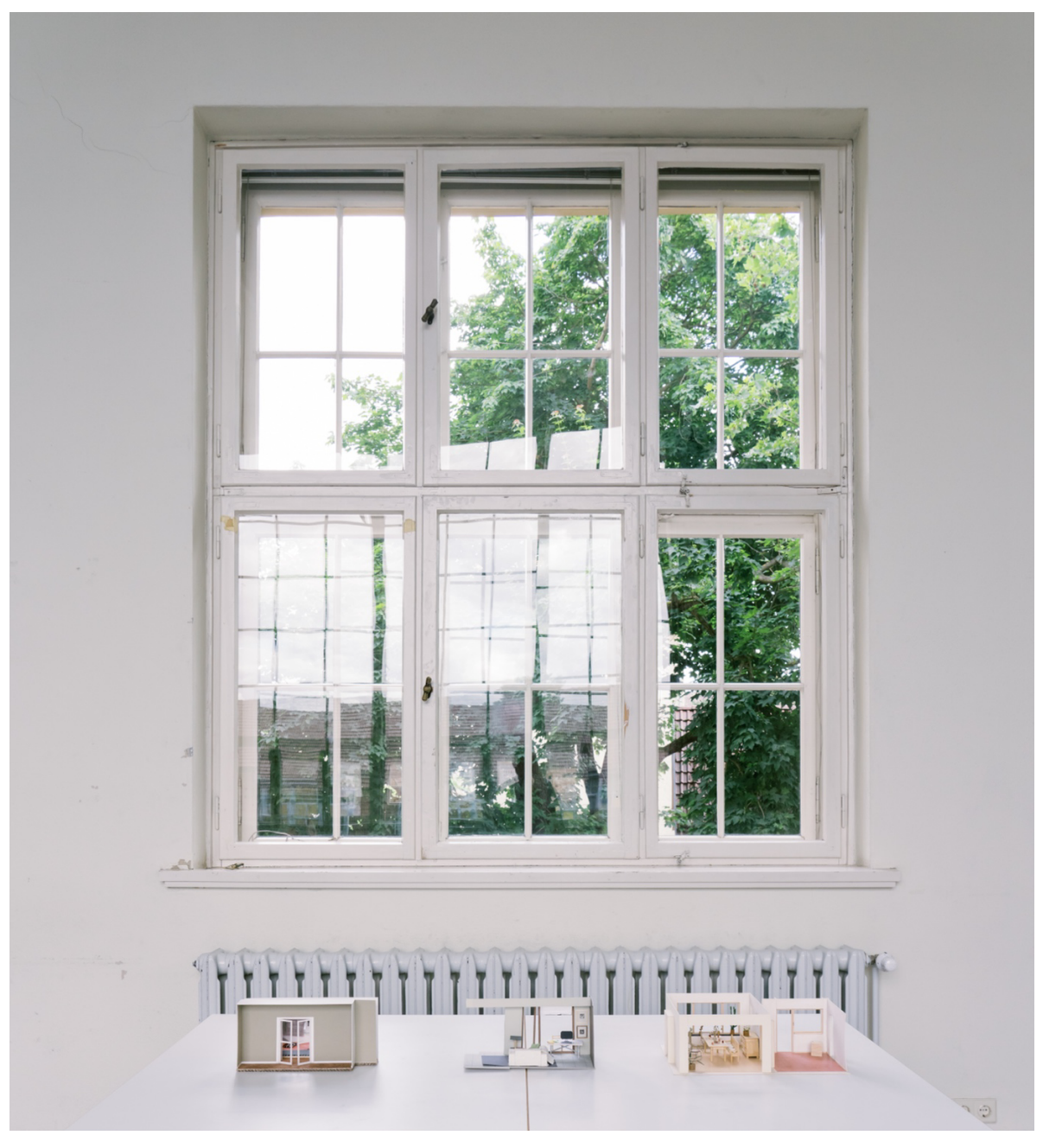
Exhibition Das Einfamilienhaus zur Disposition as part of summaery 23.